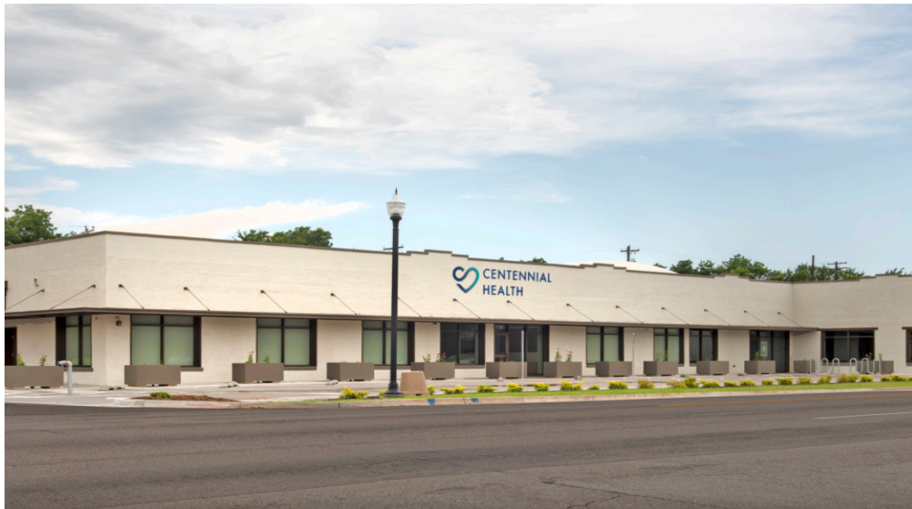
Exhibit 3: Centennial Health at 1720 NE 23 rd Street

Approximately three blocks to the east, located at NE 23 rd and Rhode Island Avenue is an exciting new retail center known as EastPoint by local developers, Pivot Project. Pivot Project has rehabilitated a former row of buildings along NE 23 rd Street. The project contains approximately 41,000 square feet of office and retail space. The buildings are home to Centennial Health , an optometrist, office buildings, restaurants, a coffee shop, as well as the recently opened Market at EastPoint . This is the first major development that has happened in the area in years. The development is a catalyst project.