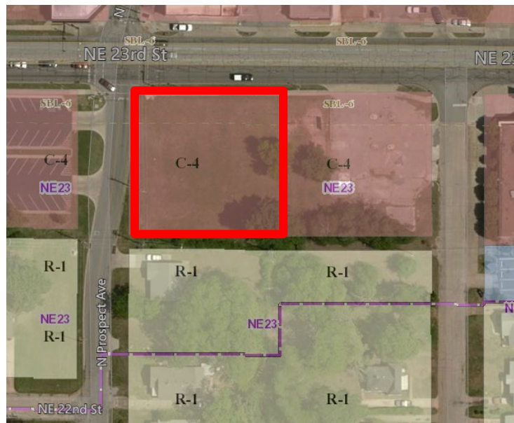
Exhibit 4: The City of Oklahoma City Zoning Requirements

C-4 – General Commercial District. The C-4 District is intended for the conduct of wholesale, retail and office business activities that serve the needs of citizens from anywhere in the metropolitan area, rather than being oriented only to surrounding residential areas. Because the permitted uses may serve and employ a large number of people from a large part of the metropolitan area, the activities conducted, and the traffic generated make this district very much incompatible with residential development. The Comprehensive Plan policy does not support further expansion of the C-4 District.