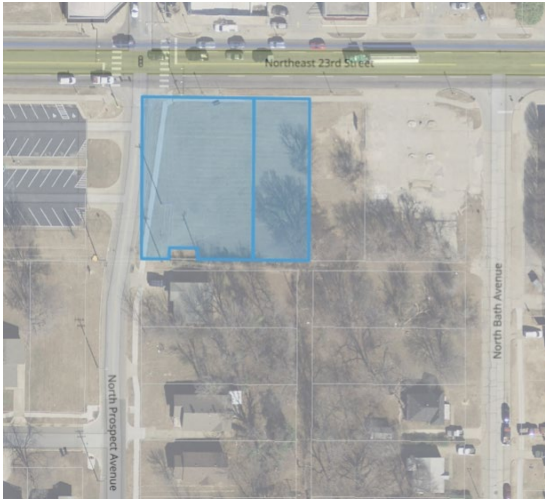
Exhibit 1: Site Location and Context Map (OCURA property depicted in blue)

The OKLAHOMA CITY URBAN RENEWAL AUTHORITY (“OCURA”) invites the presentation of written proposals from qualified developers (“Redeveloper”) for the purchase and redevelopment of approximately half of an acre tract of land, depicted on Exhibit 1 below: